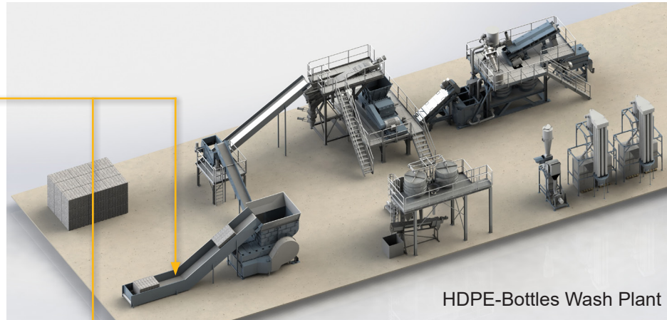
HDPE-Bottles Wash Plant