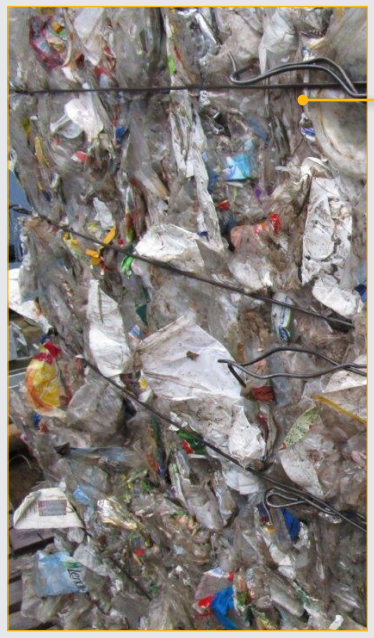
Input: Contaminated PET-Trays

Reference line: France, approx. 2,0 t/h input capacity