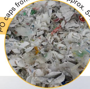
PO caps from Tetrapak (approx. 5-10%)