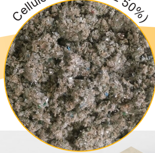
Cellulose (approx. \geq 50\% )