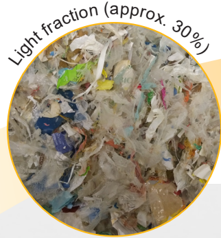
Light fraction (approx. 30%)